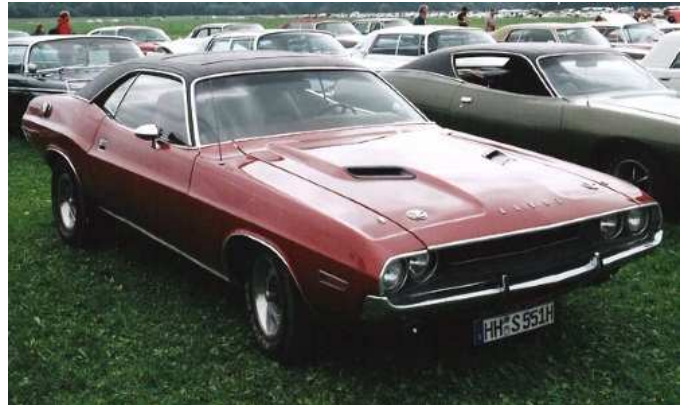
(European style plates from Hamburg, Germany)

Paint Top Inter. Engine/Trans Red Black Black ? / ? (www.transamcuda.com forum)